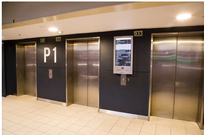
P1 North lifts and board