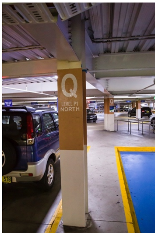
Parking column Q